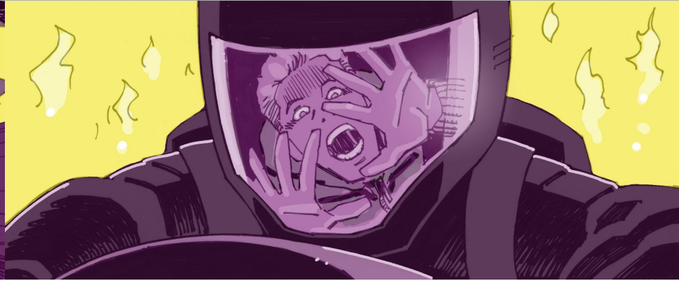
ABOVE: RESONANCE storyboard – key frames.